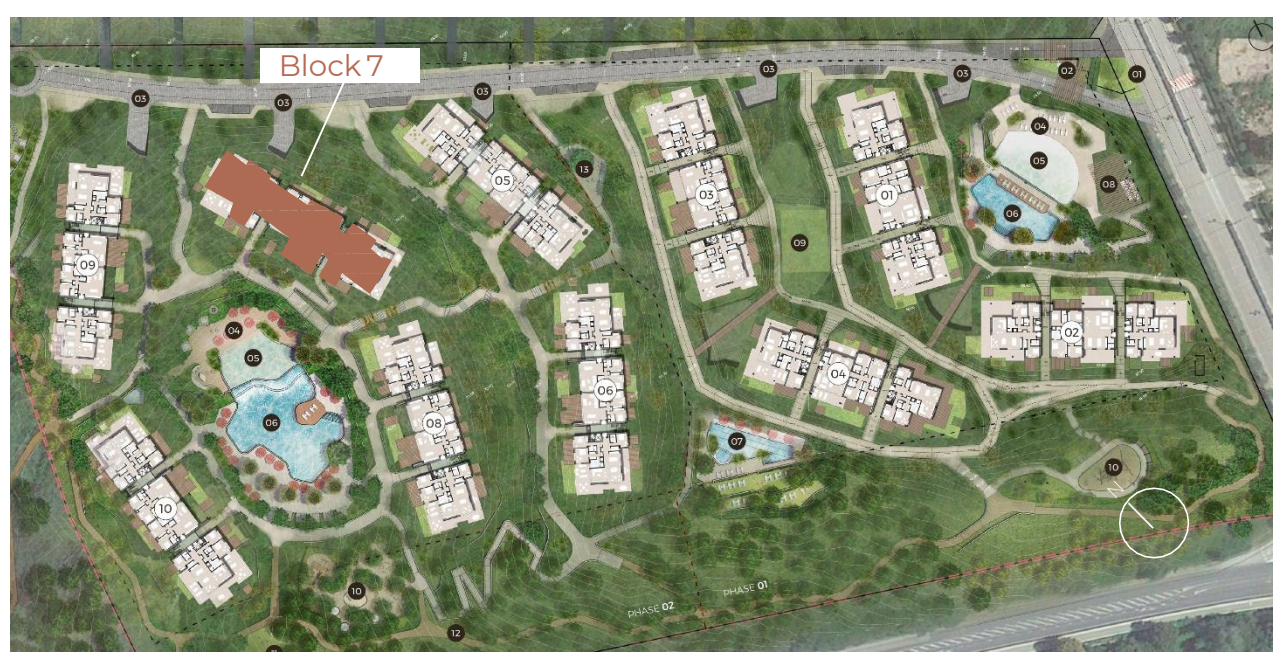
5 | 8