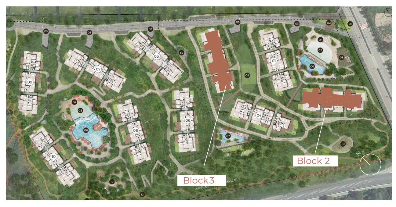
2 | 8