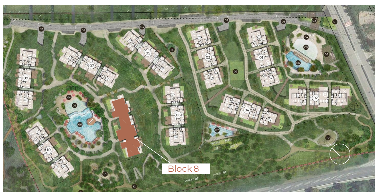
6 | 7