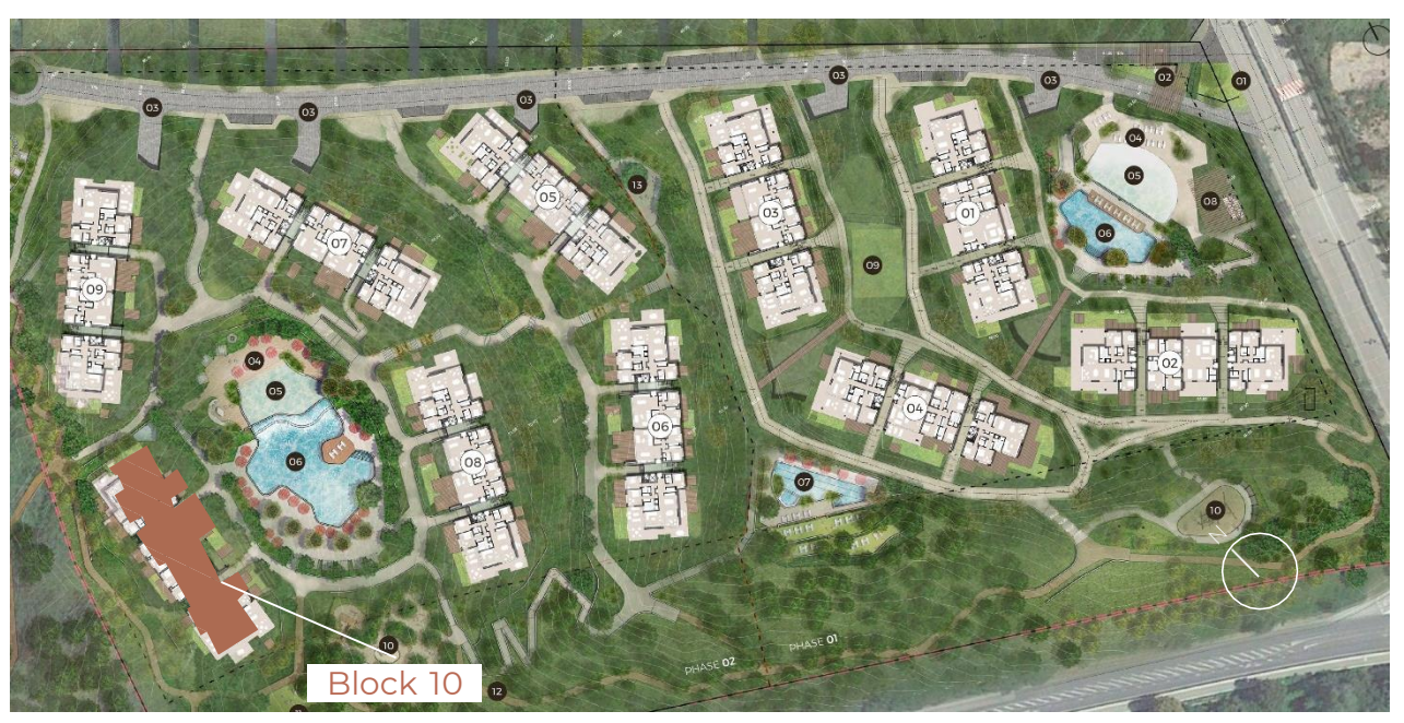
7 | 7