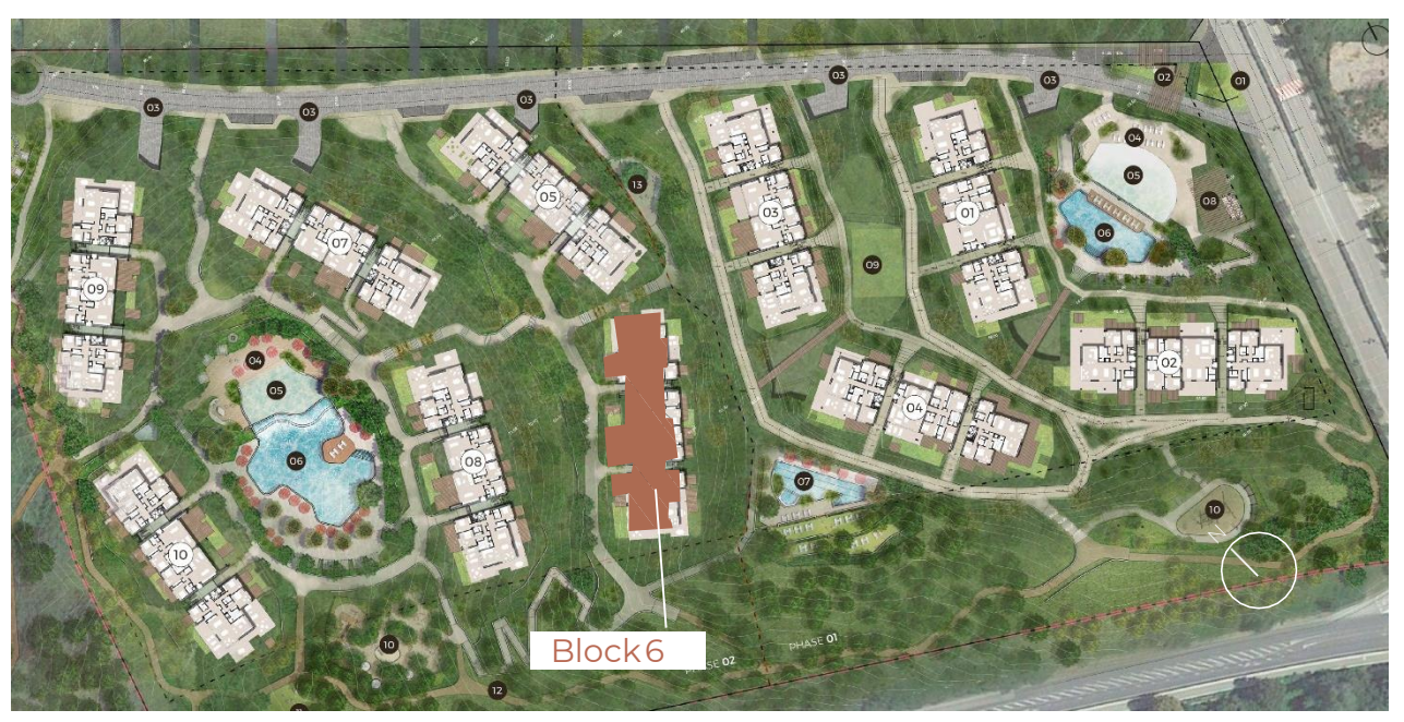
4 | 8